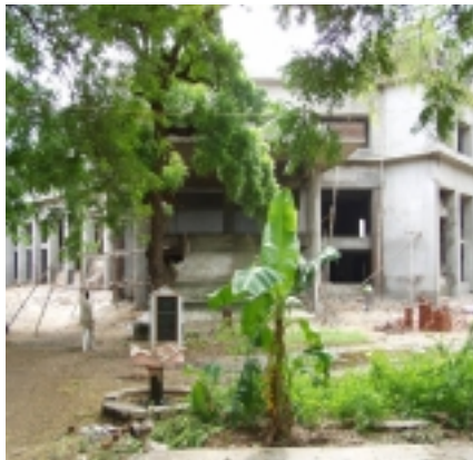
Front entrance to the Auditorium (Picture received Sep 28, 2003). Visit www.photos.gmcana.org for more recent ones.